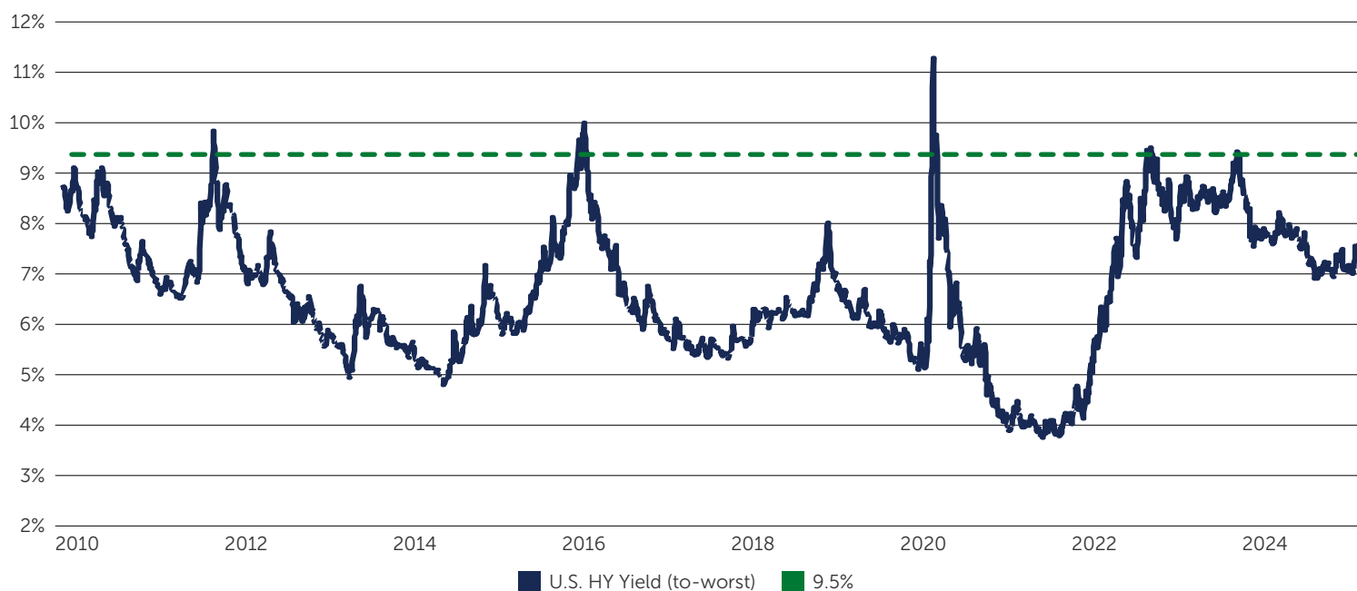
Figure 2: Yield to Worst for U.S. High Yield

In high yield, we find it informative that in all of the major sell-offs post-GFC (2011, 2015, 2020, 2022), the pressure on all-in yields started to exhaust itself in the high-9% range (save for 5-6 days in March 2020; see Figure 2 below). While there is still room for wider spreads in outcomes that mirror the 2011 and 2015 scenarios mentioned above, at 8.6% yields as of Monday's close, the carry breakevens, i.e. the return buffer that current yields provide against further widening, are already quite attractive. The value here is further bolstered by the underlying structure of the high yield market today with shorter durations, a higher quality ratings distribution, and less exposure to cyclical sectors like autos, retail, and chemicals. Given the historical observations of 9.5-10% index yields tend to be relatively brief and occur on very low trading volumes, making it very difficult to time and execute, we like building positions here while maintaining some dry powder to take advantage of any forced selling in the market.